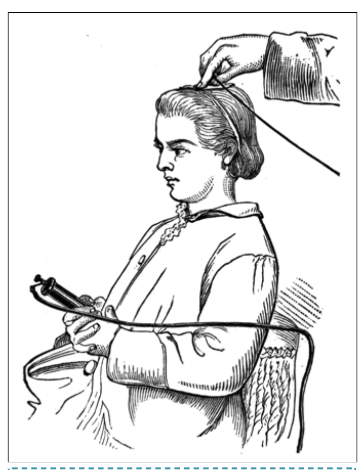
Figure 2: Electrotherapy

A person receives electrical shocks from a portable electrical device. FromGM, Rockwell AD. A practical treatise on the medical and surgical uses of electricity , 6th ed. New York, NY: Wm Wood & Co., 1888