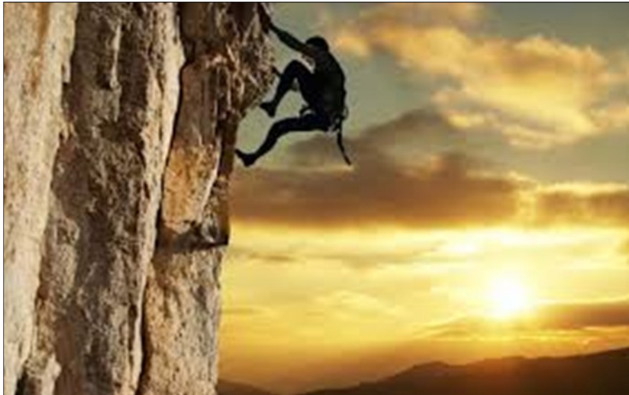
Figure 1. Motivation theme

strong desires in any actions they execute. Highly motivated individuals are such athlete or life time scientists in practice. They continuously work without thinking that how hard a task it could be in order to achieve to their goals. Motivated people have the high level of inspirations by themselves and can be inspired by any factor in space or time [2].