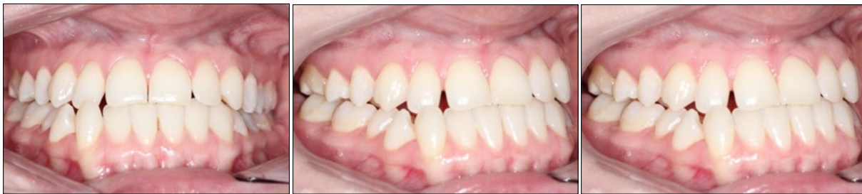
Figure 2. Initial intraoral photographs

maxilla and a protruded mandible (SNA 78 degrees and SNB 83 degrees). The patient is a hyperdivergent type, with FMA 30 degrees and IMPA 77 degrees, which suggests retruded lower incisors. Examination of soft tissue on the profile radiograph shows a concave profile and a protruded lower lip. (Figure 3)