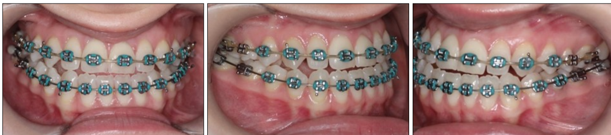
Figure 5. Pre-surgical intraoral photographs