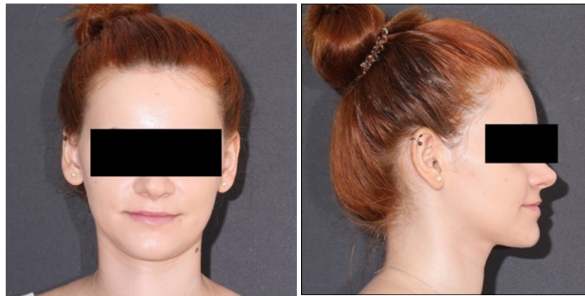
Figure 8. Post-treatment extraoral photographs