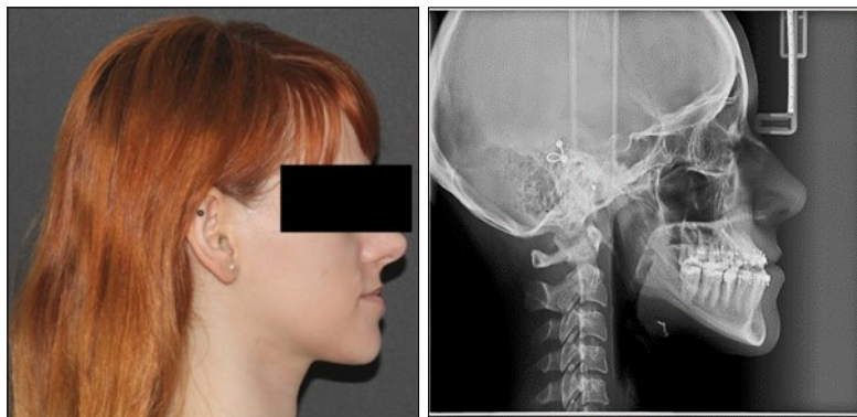
Figure 4. Pre-surgical extraoral photographs, after orthodontic preparation and preoperative lateral cephalometric radiograph