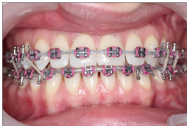
Figure 6. Post-surgical intraoral photographs, with bilateral box elastics