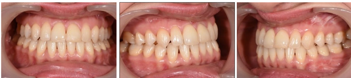
Figure 9. Post-treatment intraoral photographs

prescription and a normal sequence of archwires.