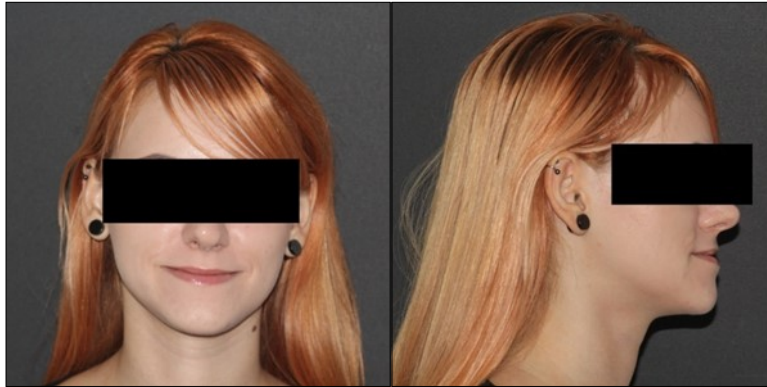
Figure 1. Initial extraoral photographs