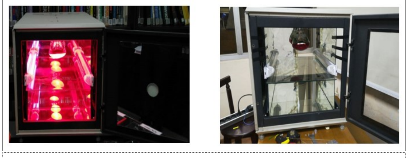
Figure 2. The implemented sterilization oven