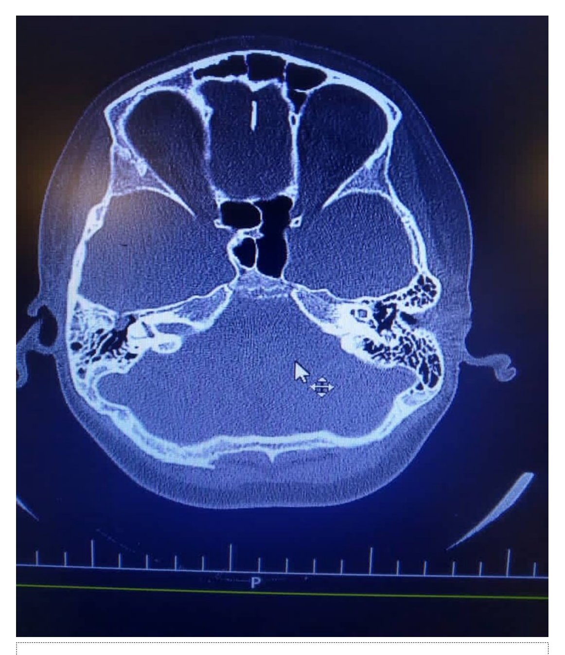
Photograph 1. There is evidence of fracture on the right roof of the right tympan. Slight opacity of right mastoid air cells is evident. There is soft tissue density in the middle ear and epitympan and preusak cavity suggestive cholesteatoma.