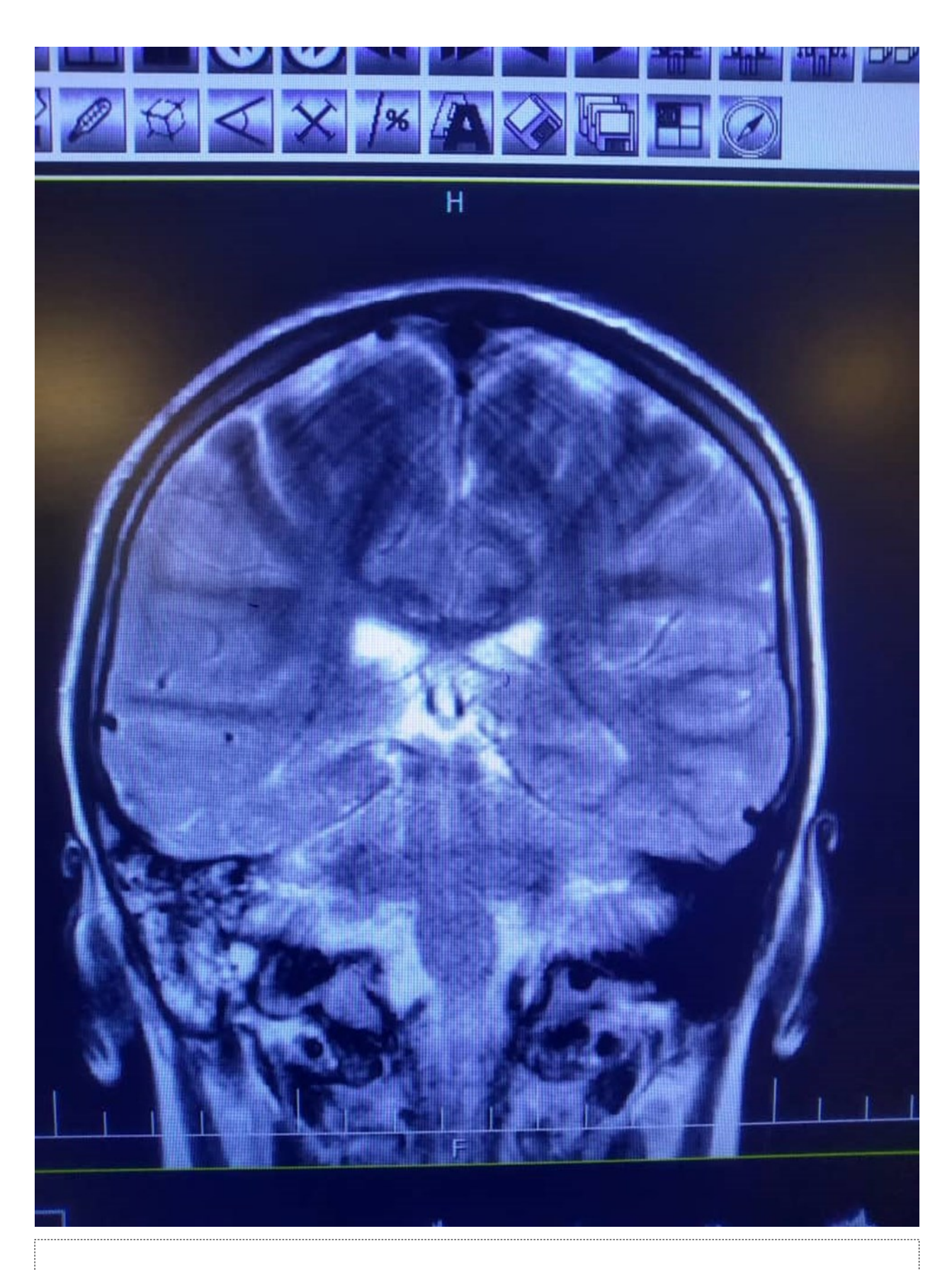
Photograph 2. High signal intensity in both hemispheres is noted suggestive of meningitis. In T2 sequence there are hyper signal material left maxillary sinuse and bilateral frontal sinuses in favour of sinusitis, polyp and retention cyst in left maxillary sinus is noted. Effusion in right mastoidal air cell is noted.