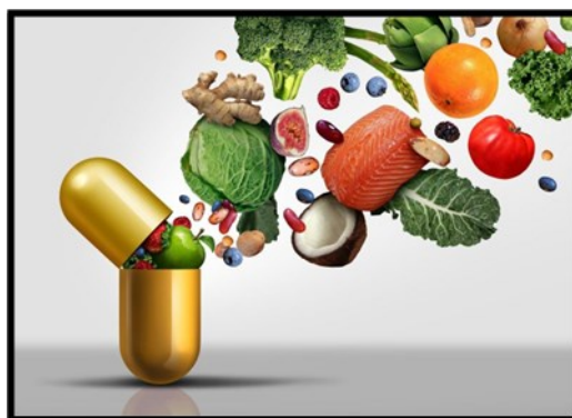
Figure 1. Nutraceuticals [14]

Nutrition (essential for health) + Pharmaceuticals (treatment of illness/injury) = Nutraceuticals (in preventative medical approach). [13]