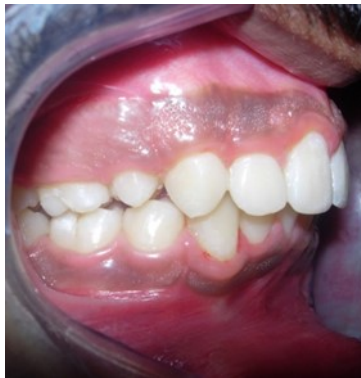
Fig.7d. Post treatment intra-oral - Right