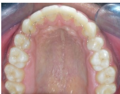
Fig.7e. Post-treatment intra-oral-Upper occlusal

have no real effect on mandibular length 6,7 while others believe that mandibular growth can be increased with functional appliance treatment 8-10 . However, Wendling 11 was of the opinion that a spontaneous correction of some Class II malocclusions is favoured with initial rapid palatal expansion. It has been reported in the literature that in the Class II, division 1 group, the retrusion was due to constriction of the maxillary dental arch and that in such cases, it is important to expand the maxillary arch to obtain a permanent orthopedic effect on the maxilla by releasing the mandible to move anteriorly.