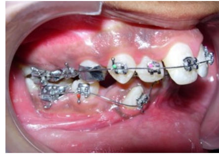
Fig.6b. Initial levelling and alignment – Upper / Lower 0.014-inch nickel titanium wires – Right