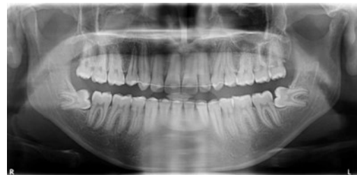
Fig.8. Post-treatment panoramic radiograph