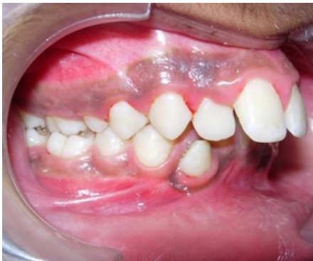
Fig.1e. Pre-treatment intra-oral-Right