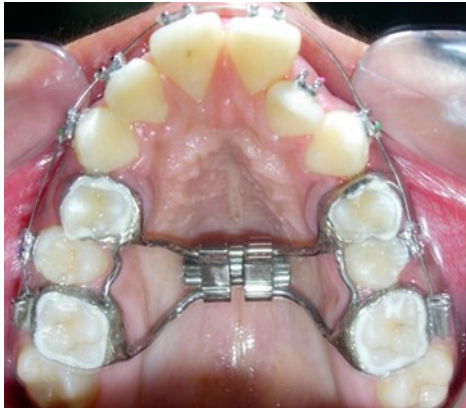
Fig.5. Rapid palatal expansion appliance in situ

13mm was effectively reduced to 3mm and the severe deep bite was also corrected (Fig.7c-d). Fixed maxillary and mandibular lingual retainers were given. (Fig.7e-f). Post orthodontic treatment, normal root inclinations of the teeth and normal alveolar bone levels was observed. (Fig.8).