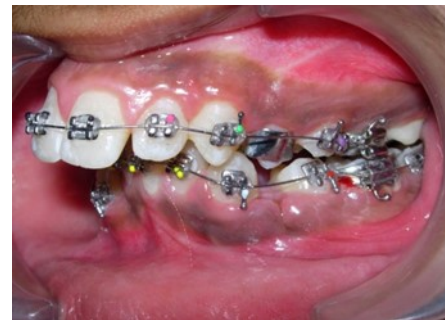
Fig.6c. Initial levelling and alignment – Upper / Lower 0.014-inch nickel titanium wires – Left

Bilateral posterior cross bite with severe skeletal Class II malocclusion is a routinely encountered malocclusion in an orthodontic practice. The probable causes for skeletal posterior crossbite could be hereditary, airway obstruction, non-nutritive sucking habits, lowered tongue position, and early loss of primary teeth. The skeletal malocclusion in the case reported had an orthognathic maxilla and retrognathic mandible with severe maxillary constriction. Some authors are of the opinion that functional appliances