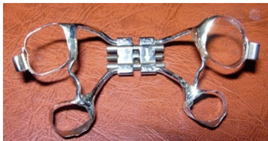
Fig.4. Banded Rapid Palatal Appliance

tissue profile. The initial phase of treatment was initiated with a banded rapid palatal expansion appliance to correct the bilateral maxillary posterior crossbite. (Fig.4). Subsequent to correction of the same, maxillary and mandibular first premolars were extracted and the orthodontic phase was commenced to correct the severe crowding of the maxillary and mandibular dental arch.