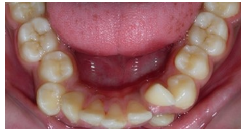
Fig.1h. Pre-treatment intra-oral-Lower occlusal

erupted and buccally placed with transpositioned 42 and 43, with 42 mesiolingually rotated, 33 distolingually rotated and 34 distolingually rotated and buccally placed.