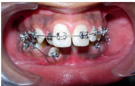
Fig.6a. Initial levelling and alignment – Upper / Lower 0.014-inch nickel titanium wires – Frontal

Post treatment lateral cephalometric radiograph was taken to assess the treatment changes. (Fig.9). The changes in maxilla in the anteroposterior direction was insignificant, however an increase in the length of the mandible measured from Condylion (Co) to Gnathion (Gn) and an increase in anterior facial height was observed. Maxillary incisors were retracted dramatically by 8mm and the mandibular incisors were proclined by 3mm to camouflage the skeletal class II malocclusion. (Table 1). Effective expansion of the maxillary constriction as an end-of treatment goal was achieved. (Fig.10a-b).