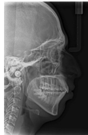
Fig.9. Post-treatment lateral cephalometric radiograph