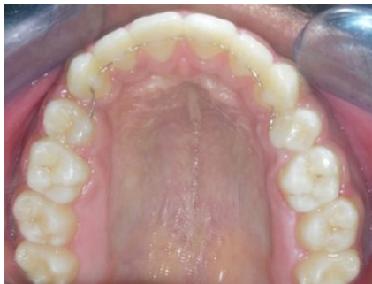
Fig.10b. Post expansion - maxillary arch

Literature reports too point to a strong correlation of deficient maxillary arch width and Class II malocclusion. 12, 13 In compliance with this tenet banded Hyrax was used to expand the maxilla to permit spontaneous forward positioning of the mandible. The rapid maxillary expansion appliance widens the intermaxillary suture and increases basal bone width 14- 17 as also causes an increase in dental arch perimeter 18 as had been observed in the treated case too. Post treatment cephalometric analysis revealed an increase in length of the mandible with no orthopaedic functional device given to jump the mandible. This could most probably have been attributed to the widening of the constricted maxilla with the banded rapid maxillary expansion appliance that promoted the mandible to express normal growth in an anterior direction. However mandibular growth was not sufficient enough to correct the severe anteroposterior skeletal discrepancy but the dentoalveolar compensation was maximized. The increased overjet of 13 mm was reduced to 3mm at the end of treatment most probably attributed to retroclination of the maxillary anteriors and proclination of the mandibular incisors. The mesial movement of the mandibular arch