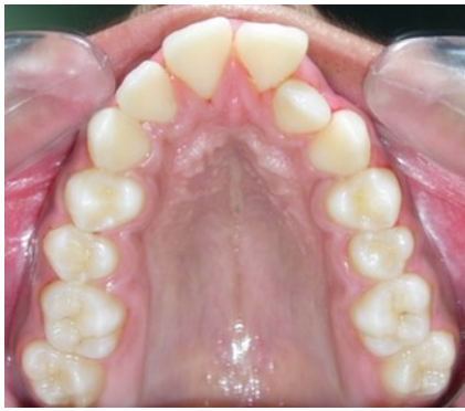
Fig.10a. Pre expansion - maxillary arch