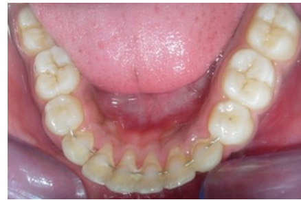
Fig.7f. Post-treatment intra oral-Lower occlusal