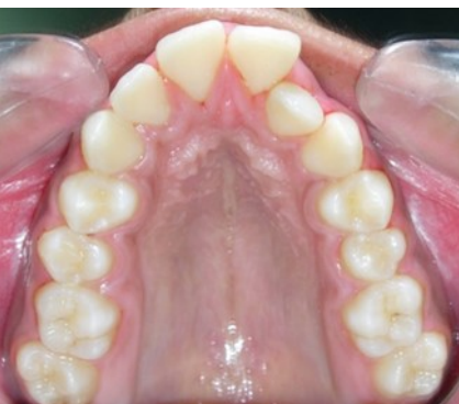
Fig.1g. Pre-treatment intra-oral-Upper occlusal