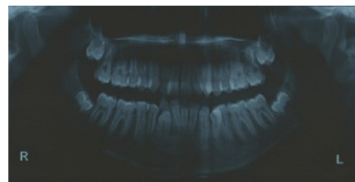
Fig.2. Pre-treatment panoramic radiograph

The main treatment objective was to improve the phonation, lip competence, smile esthetics and soft