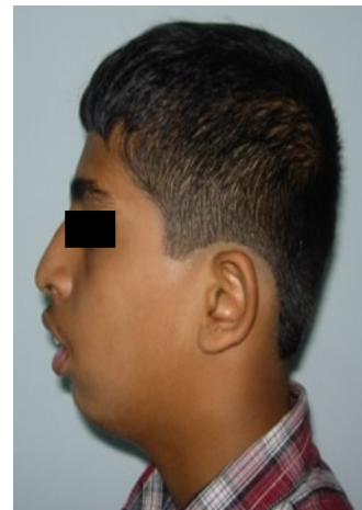
Fig.1b. Pre-treatment extra-oral-Profile