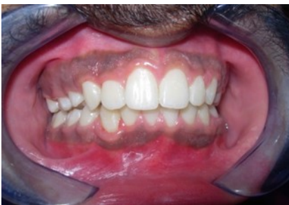
Fig.7c. Post-treatment intra-oral-Frontal