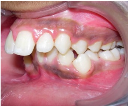
Fig.1f. Pre-treatment intra-oral-Left