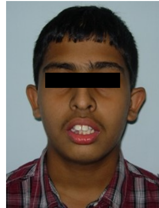
Fig.1a. Pre-treatment extra-oral-Frontal

The patient had a leptoprosopic face, convex profile, posterior divergence, incompetent lips, clinical high mandibular plane angle, complete maxillary incisor display on smiling with no signs of temporomandibular joint dysfunction.