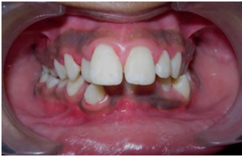
Fig.1d. Pre-treatment intra-oral-Frontal