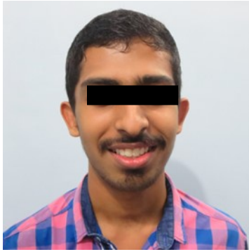
Fig.7b. Post-treatment extra-oral-Smiling