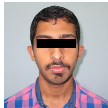
Fig.7a. Post-treatment extra-oral-Frontal

Bilateral posterior cross bite with severe skeletal Class II malocclusion is a routinely encountered malocclusion in an orthodontic practice. The probable causes for skeletal posterior crossbite could be hereditary, airway obstruction, non-nutritive sucking habits, lowered tongue position, and early loss of primary teeth. The skeletal malocclusion in the case reported had an orthognathic maxilla and retrognathic mandible with severe maxillary constriction. Some authors are of the opinion that functional appliances